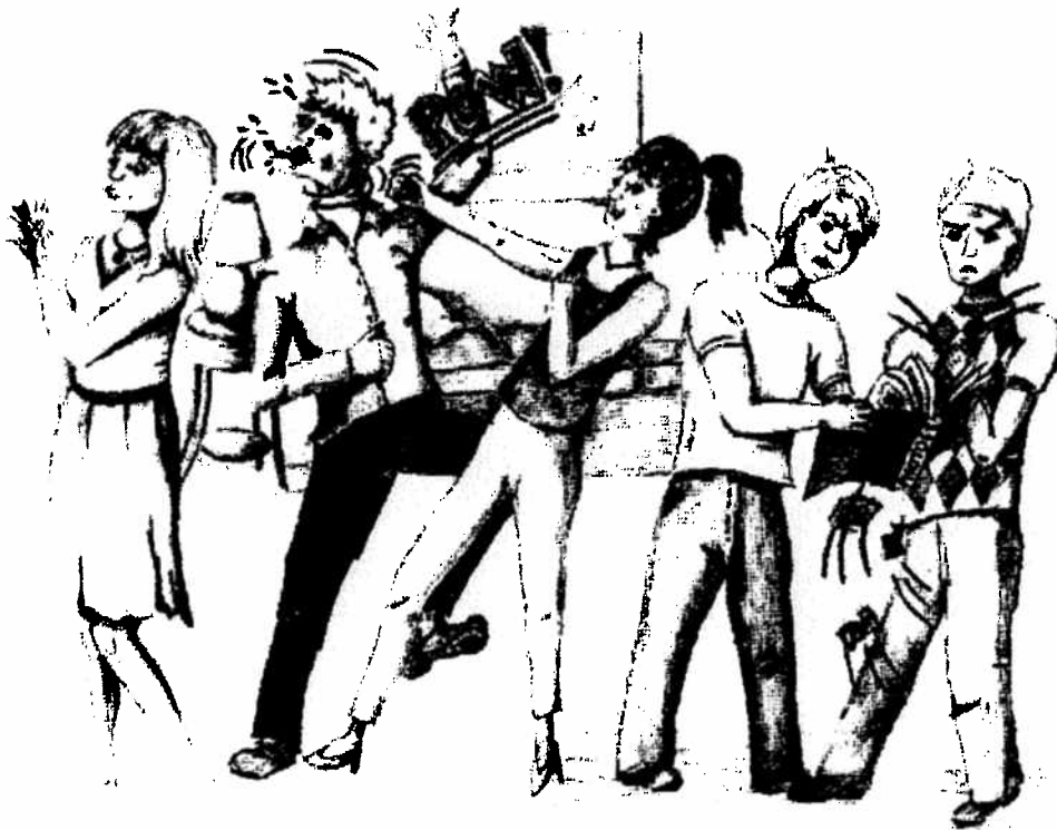
2008. Dividing Mom's "stuff" after she died without a will.