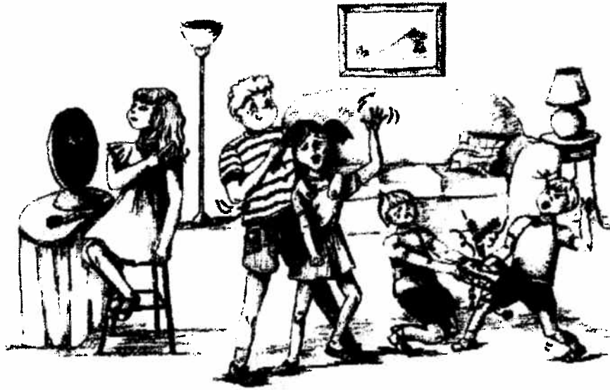
1986. The kids were a handful.